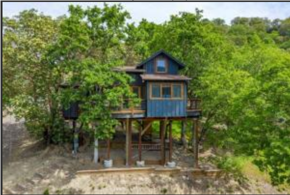
7652 photos (26)