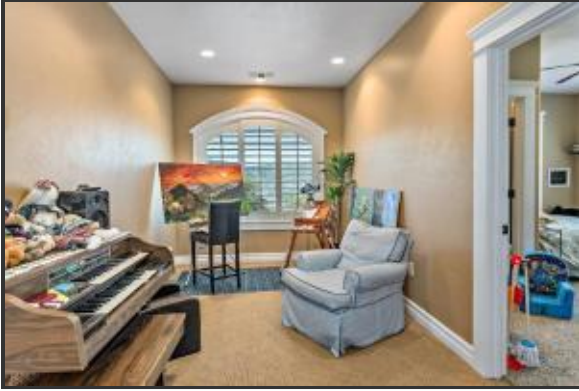
7652 photos (20)