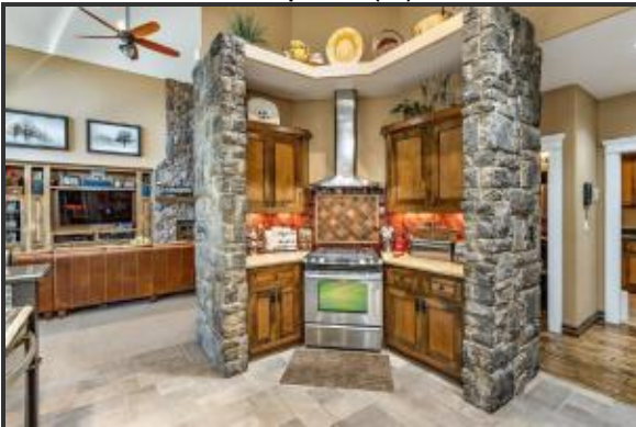
7652 photos (10)