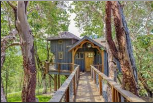
7652 photos (6)