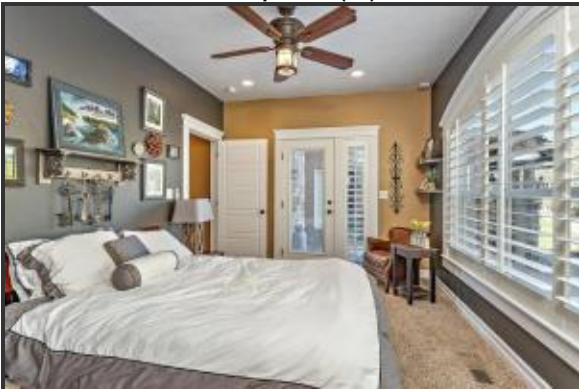
7652 photos (16)