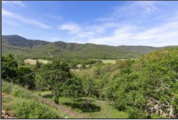
7652 photos (33)