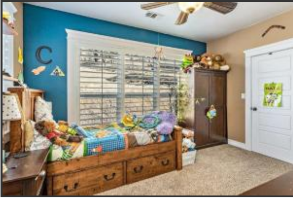
7652 photos (22)