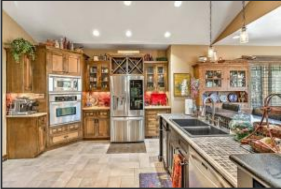
7652 photos (8)