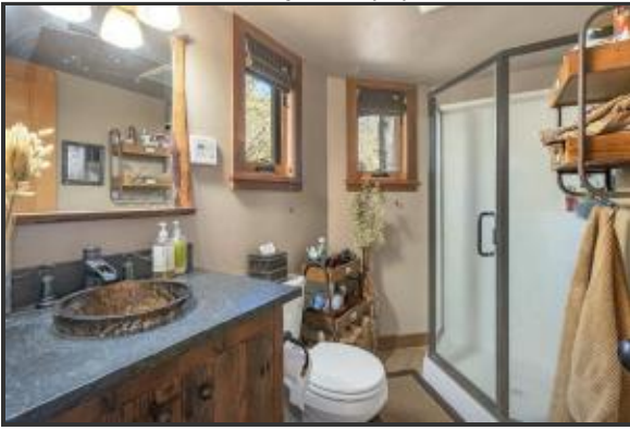
7652 photos (30)