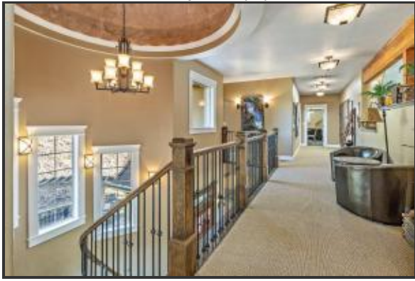
7652 photos (19)