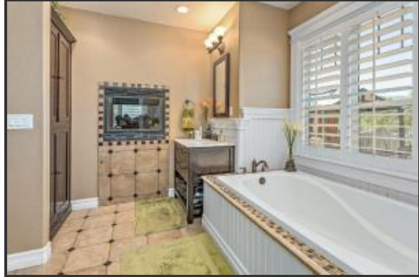
7652 photos (15)