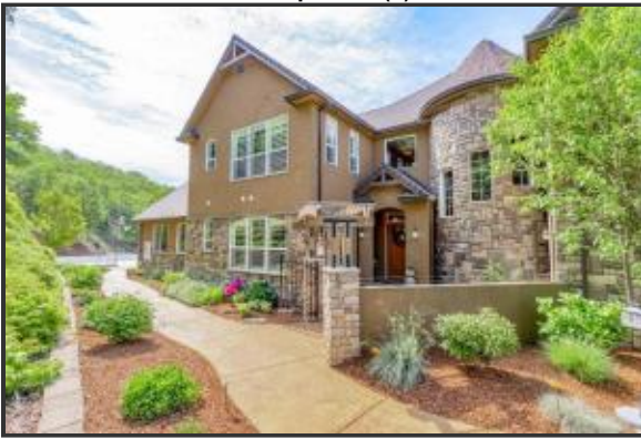
7652 photos (2)