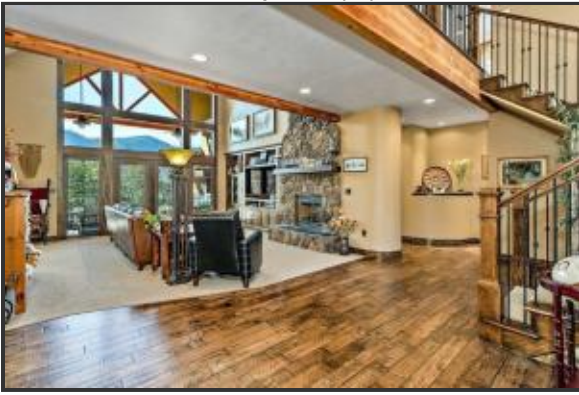
7652 photos (12)