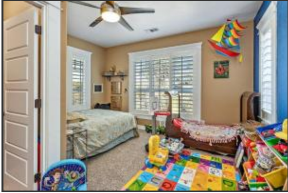
7652 photos (21)