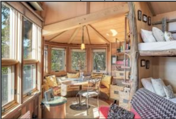
7652 photos (28)