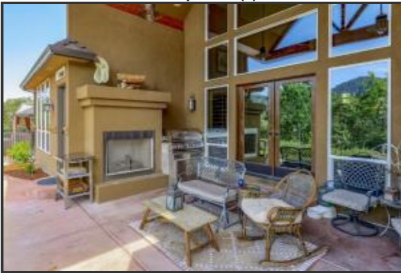
7652 photos (4)