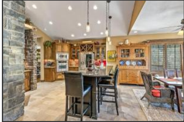
7652 photos (9)