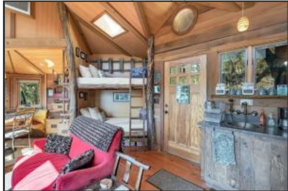
7652 photos (27)