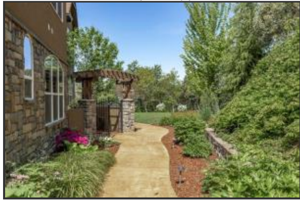
7652 photos (7)