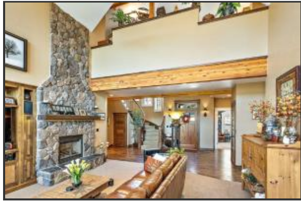
7652 photos (13)