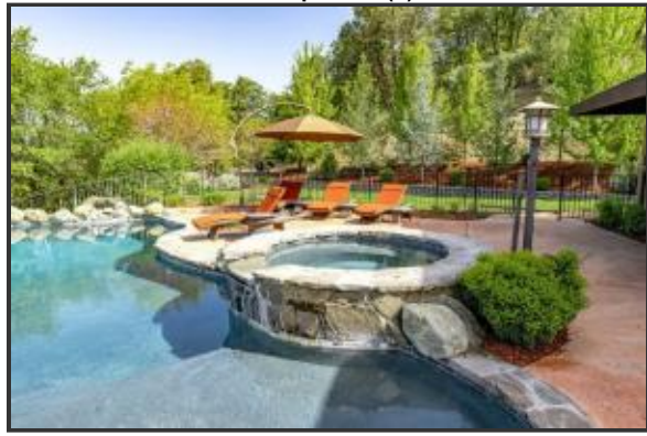
7652 photos (3)