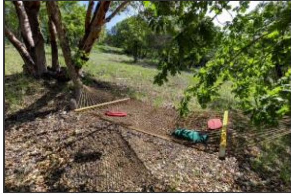
7652 photos (34)