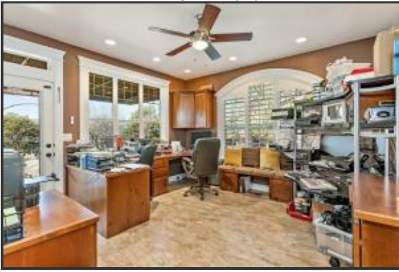
7652 photos (18)