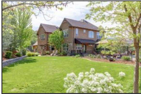
7652 photos (25)