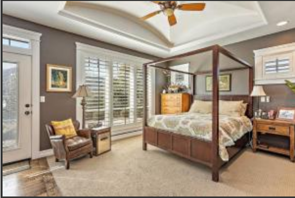
7652 photos (14)