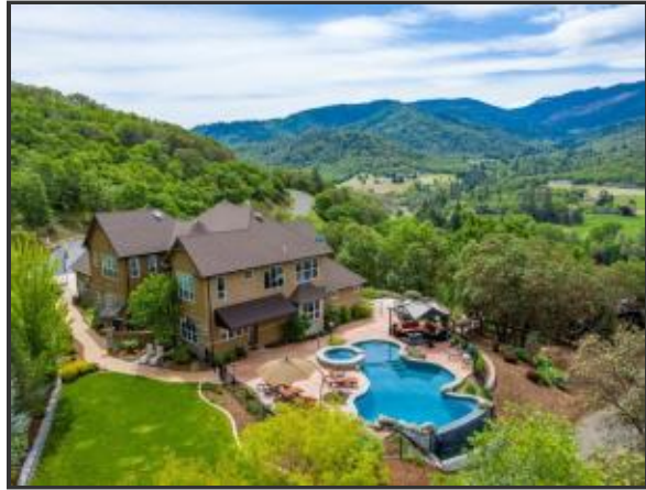
7652 photos (1)