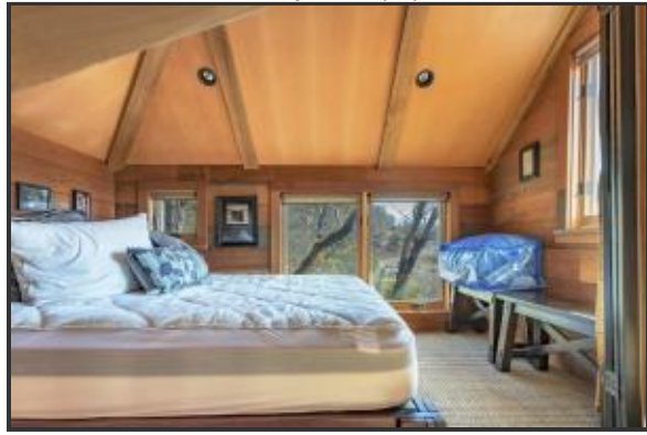
7652 photos (31)