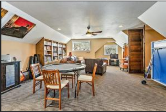
7652 photos (24)